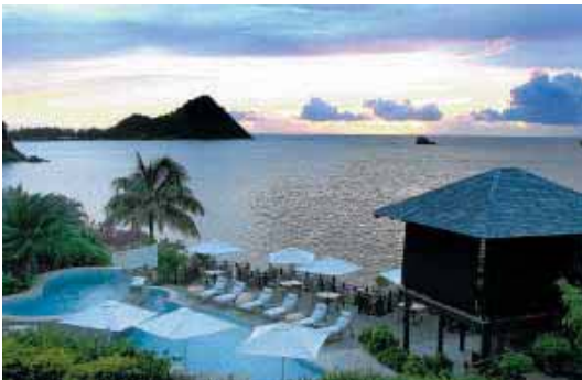
The view from one of the bedrooms at Ladera Resort